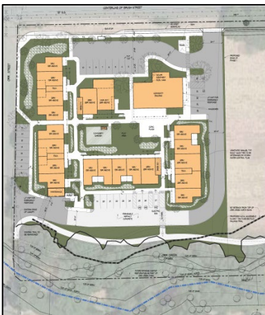
Phase I ~ Orr Creek Commons

In 2019, RCHDC moved forward in obtaining its Use Permit to develop this eight-acre site and acquired the funding needed to commence construction on Phase I of Orr Creek Commons, which will be breaking ground during the first week of March 2020. With RCHDC able to move forward on Phase I of Orr Creek Commons, the Center is now positioned to launch its own development plans for a new community center and Thrift Store at the corner of Brush Street and Orchard Avenue on the remaining RCHDC parcel.